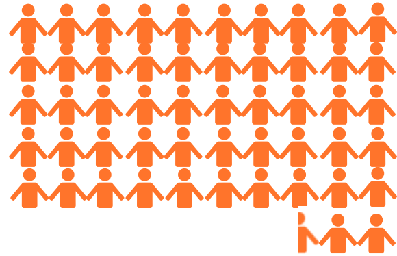
each person represents 20 exams